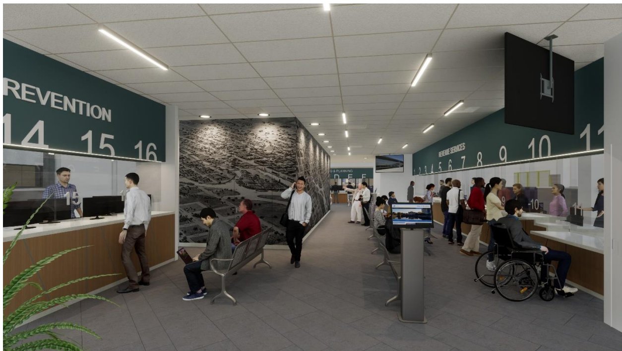
The first rendering (above) shows the primary customer/counter area to the existing Permit Center, Revenue Services, and Fire Prevention.

The following renderings are from the contractor to visualize the City Hall updates.