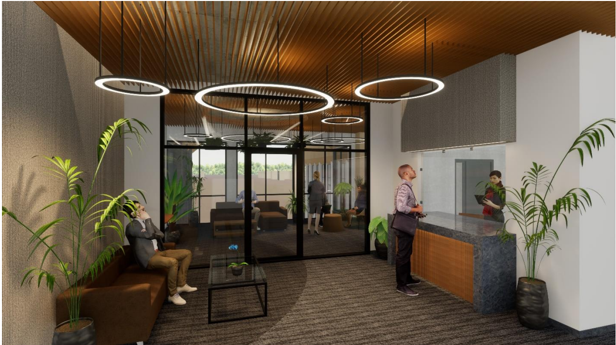
The 3 rd render (above) is City Council/Mayor/Manager's Floor. This is the view one would see walking out of the elevator.