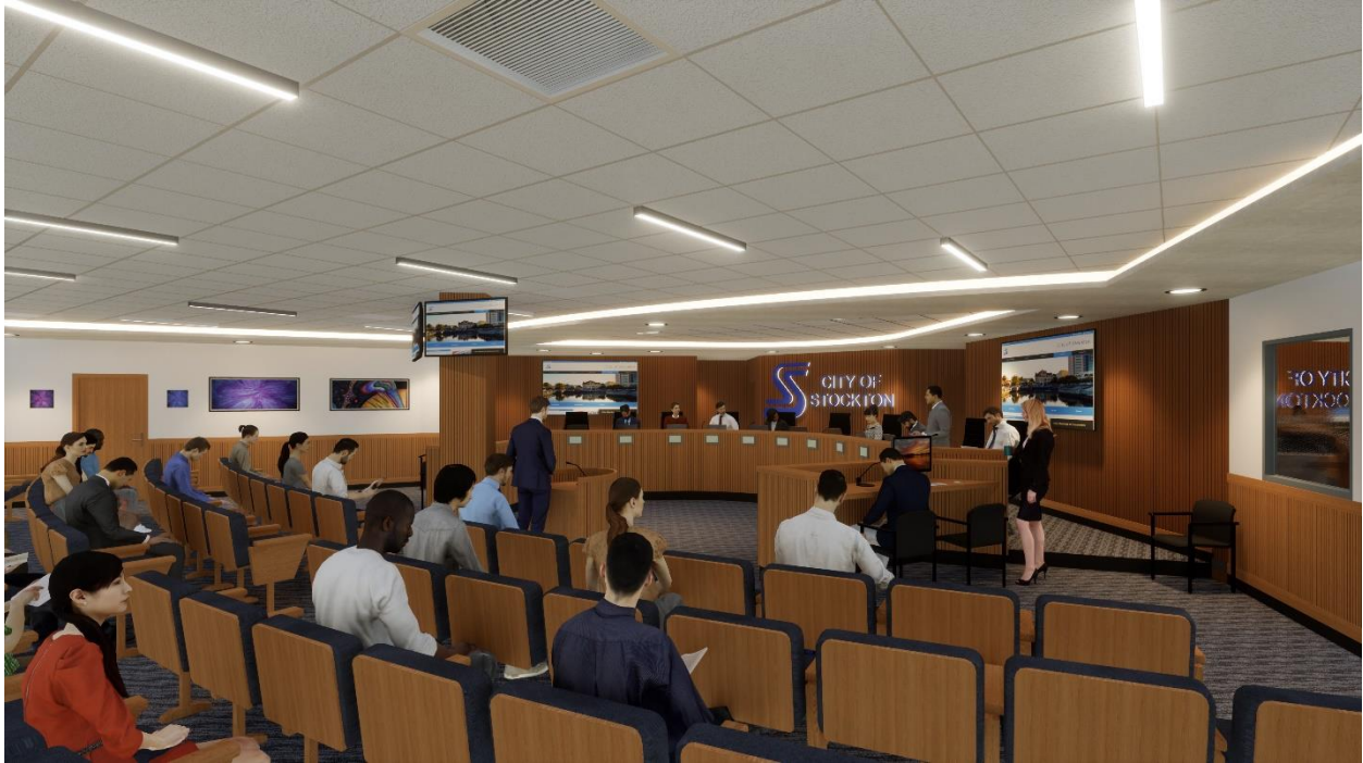
The 2 nd rendering provided (above) is of the new City Council Chambers. This new space will have a capacity of 98 with 4 ADA seats.